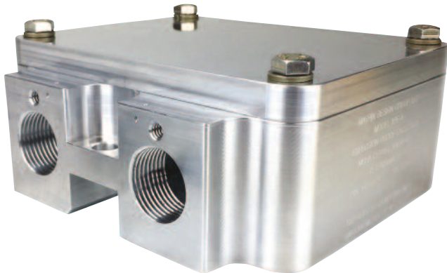
MODEL XPE-4 XP SQUARE ENCLOSURE WITH LID

CONTACT YOUR MATRIX REP FOR MORE INFORMATION